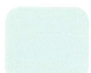
9918 Light Blue