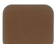
9981 Brown Bear