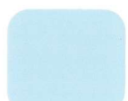
9901 Sky Blue