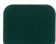
9928 Army Green