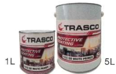
1932 QD White Primer - Oil Based (1 coat)