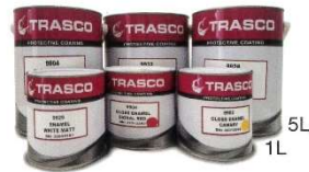
Trasco 9000 series Enamel Gloss (2 coats)