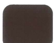
9942 Chocolate Chip