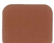
9983 Copper Brown