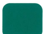
9948 Mid Green