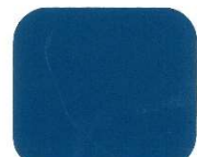
9998 Deep Blue