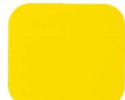
9915 Popcorn Yellow