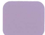
9961 Romance Purple