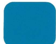
9908 Ocean Blue