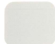
9993 Natural Grey