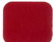
9904 Signal Red