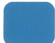
9962 Sea Blue