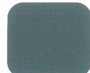
9925 Dark Grey