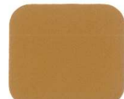
9927 Bee Honey